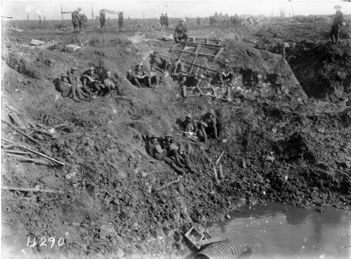
Engineers at Spree Farm